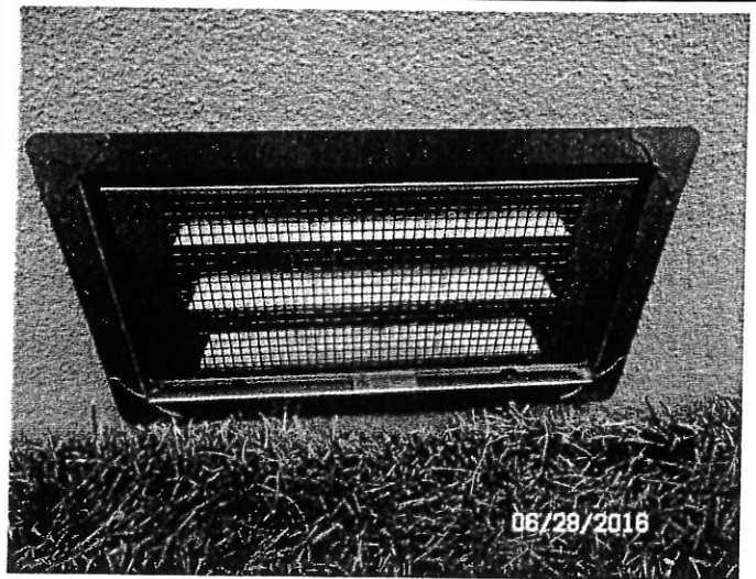
Vent View – Date of Photograph: (See Photo Stamp)